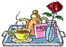
Mother's Day Buffet