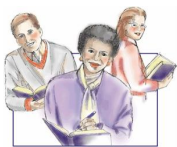
Lenten Scripture Study Group