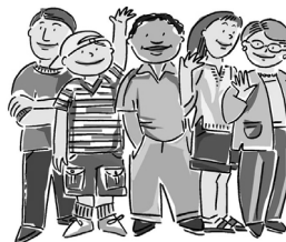
Volunteers Needed for: Vacation Bible School

Vacation Bible School -Registrations will be taken on a first come first serve basis. A limit has been set at 125 children. Begins June 21 thru 25 from 8 : 3 0 a m — 1 2 : 1 5 p m Registration fee $40.