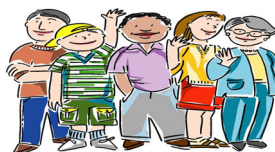
Volunteers Needed for: Vacation Bible School

The job entails helping in small groups of children leading them around from station to station.