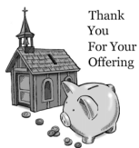
Thank You For Your Offering

Average Weekly for March 29th (Based on 37 weeks) $11,969