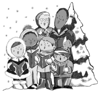
Christmas Caroling At The Convalescent Homes