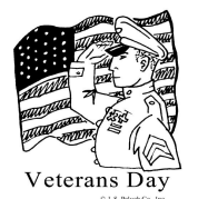
Veterans Day

The Parish Office will be closed on Friday, November 10, 2006 in observance of Veteran's Day .